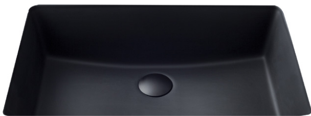
Black Silk Matte