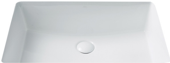
White Silk Matte